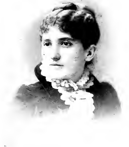
HELEN H. GARDNER.